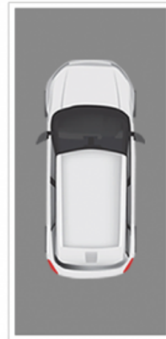
SECURE CAR SPACE

Total Area: 107m 2 Internal Area: 92m 2 Car Space: 14m 2 Storage: 1m 2