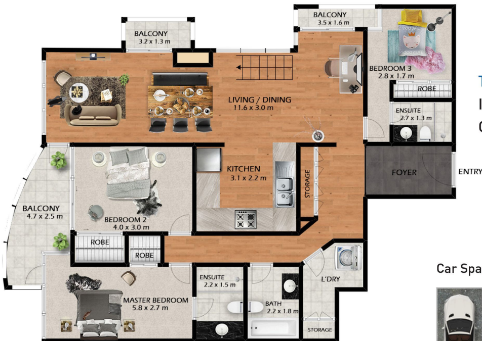
Level 32 - 150m 2

Total Area: 259m 2 Internal Area: 222m 2 Car Spaces: 37m 2